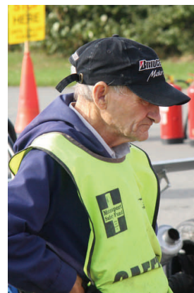
September Sprint's Marshal of the Day.

Don't forget the LMC Forum. It's a great source of up to the minute information, news and a great place to sell your car or any surplus spares.