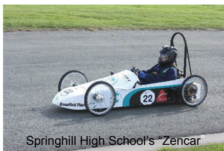
Springhill High School's "Zencar"